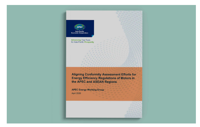
Policy Recommendation Report, APEC