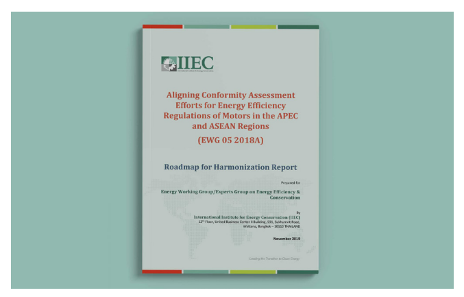
Roadmap for Harmonization Report, IIEC