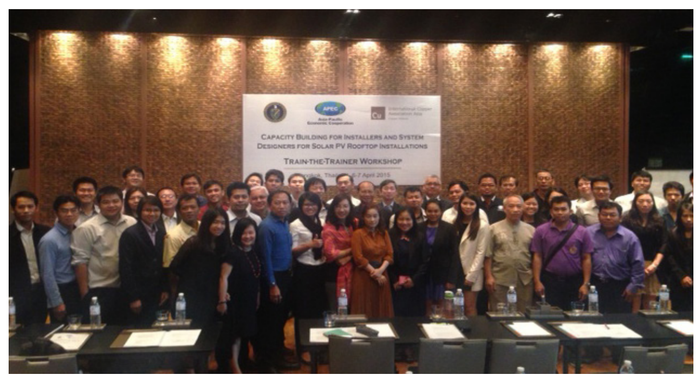
"Train-the-Trainers" Workshop, Bangkok, 2015