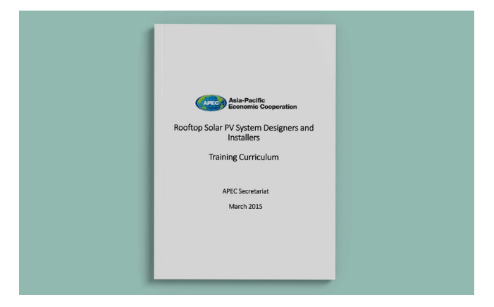
Training curriculum - https://www.apec.org